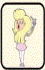
Brush your hair