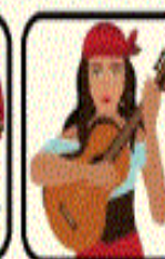
Play the guitar