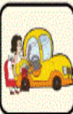
Wash the car