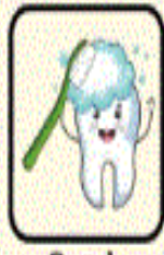
Brush your teeth