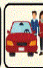
Go out with a friend