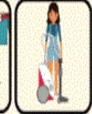
Vacuum the floor