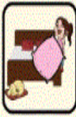
Make my bed