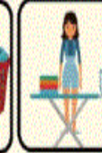
Iron the clothes