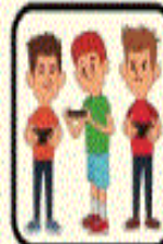
Play with friends