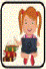
Surf the net