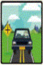
Drive to work