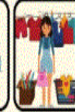
Hang the clothes