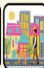
Go for a walk