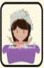
Take a bath