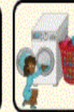
Do the laundry