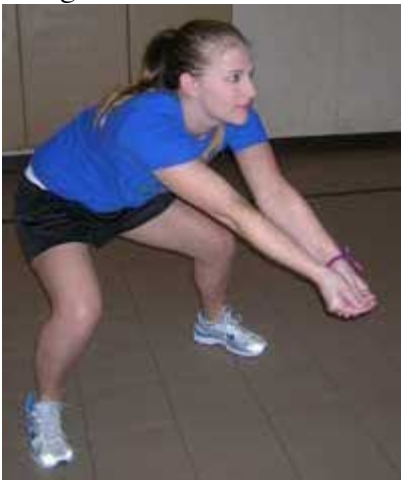
Ready to receive the ball

If you do this correctly, the ball will be more controlled, and it will go where you want it to go.