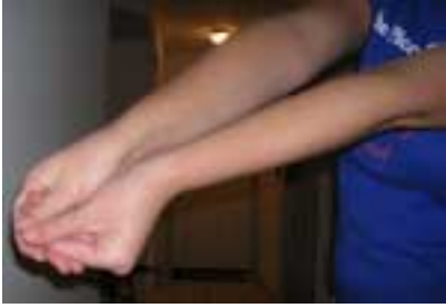
The Cup Method.

DO NOT use interlocking fingers! This is dangerous! It's so easy to break your fingers.