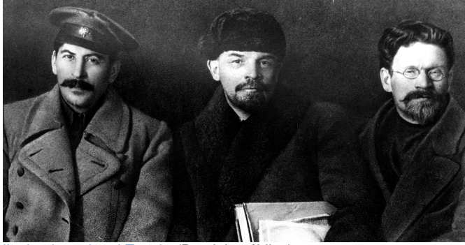
Stalin, Lenin and and Trotsky