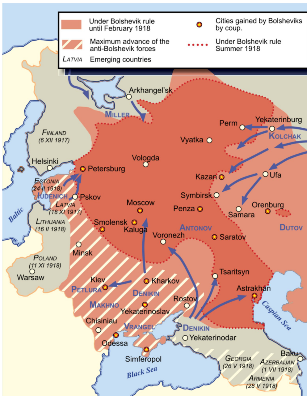
Hoodinsky. Russian Civil War (CC BY)

The Bolsheviks finally won the Civil War in 1921.