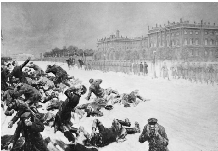
Ivan Vladimirov. Artistic impression of Bloody Sunday in St. Petersburg (Dominio público)

In 1900 Russia was a poor country compared with Western Europe. The peasants were no longer serfs , but their life was still poor and primitive. They had no say in the government. Tsar Nicolas II had absolute power in Russia, he had complete control over the government.