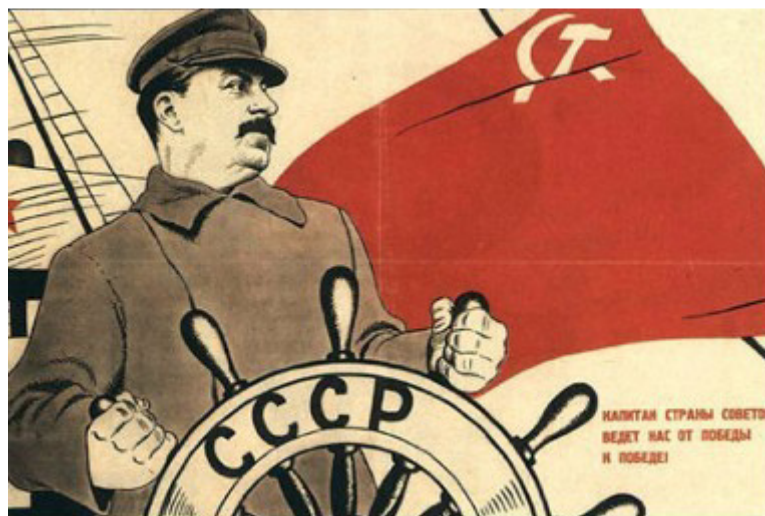
Stalin Poster (CC BY-SA)

Stalin turned the Soviet Union into a personal dictatorship where the communist ideal was still alive but filtered by his powerful personality. He ruled over the USSR using three tools.