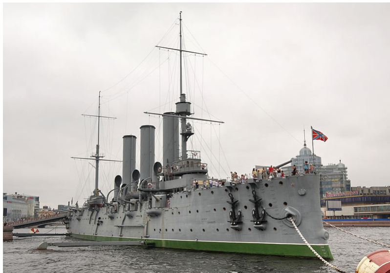
Otto Jula. Cruiser Aurora (CC BY-SA)

Leon Trotsky set up the Red Guards, a Bolshevik military force. On the 23rd of October (1917) a revolution took place. The Bolsheviks, led by Lenin, attacked the winter Palace in St. Petersburg and seized power. Bolsheviks moved the capital to Moscow and made peace with Central Empires: Treaty of Brest–Litovsk (Unit 5)