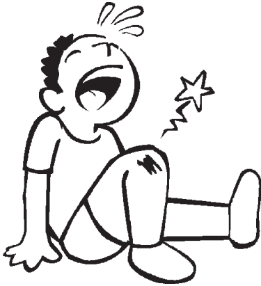
4. Touching a cut or open sore.