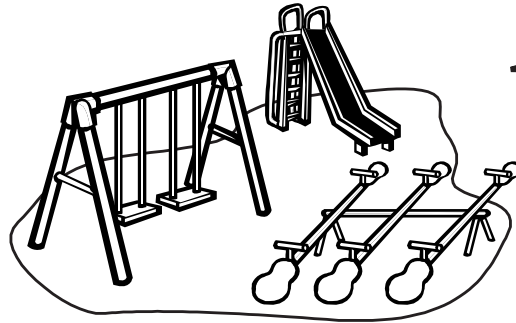
5. Playing outside.