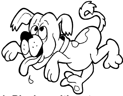
1. Playing with pets.