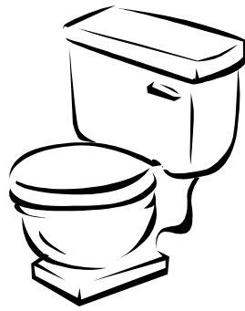
2. Using the bathroom.