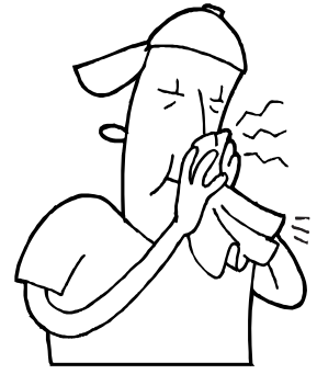
3. Sneezing, blowing your nose or coughing.