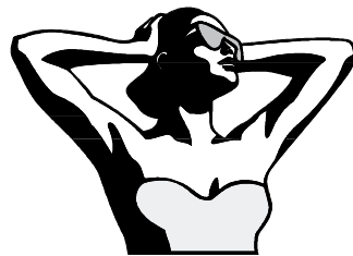
TABLA DEL 4