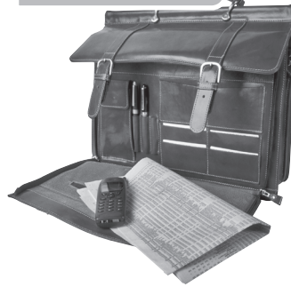
3 hand luggage