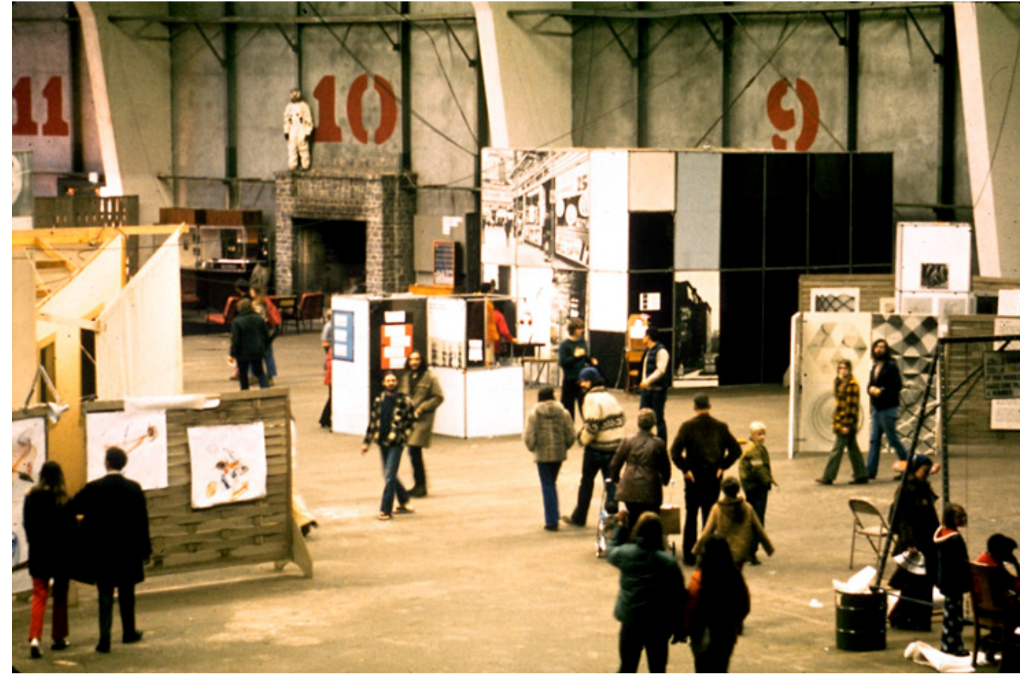
The Exploratorium's museum floor on a casual afternoon in the early 1970's

In the process of mapping nature and substantiating this mapping, scientists have unearthed an ever increasing number of natural phenomena and processes. In fact, the previously unsuspected things that are happening around us, near and far away, inside and outside of us, minute and unimaginably large, now constitute the wonders of the world. A part of the pleasure of teaching lies in making it possible for people to appreciate these wonders.