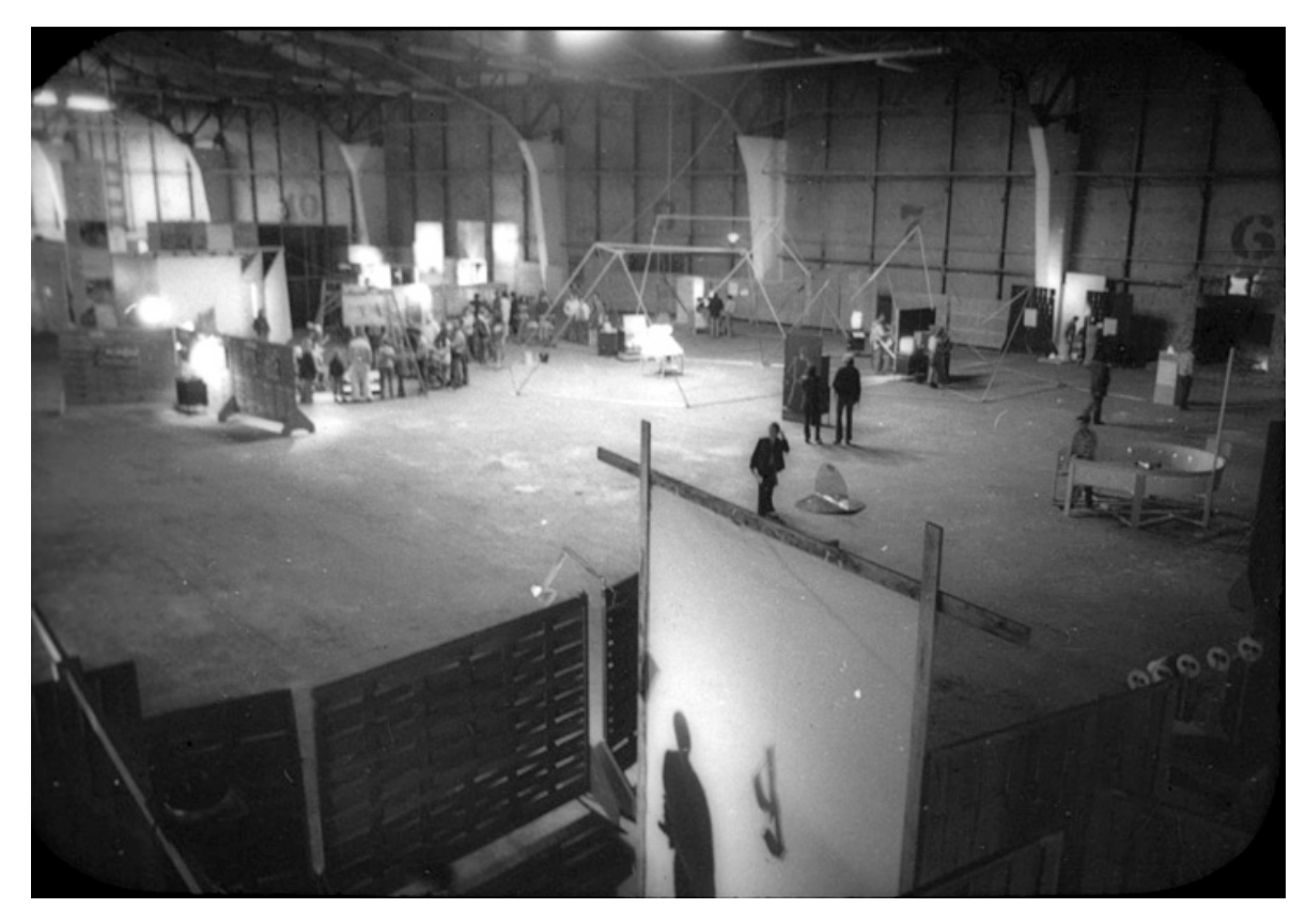
The Exploratorium, not long after opening, in the early 1970's

differs from person to person. But once established, they seem very absolute, for the contradictory evidence produces no sense of confusion or doubt about the conclusion. It would be interesting to discover whether art enables people to rearrange their own perceptual hierarchies. Hierarchies must enter into all kinds of judgments and may account for the stubbornness of those that involve skin color or some particular foreign accent. Scientists pride themselves on being immune. at least in a narrow domain, to the illusion producing compulsion of such hierarchies. In fact, a frequently avowed objective of science teaching stems from this pride, and it would indeed be fine if demonstrations on the mechanisms of perception suggested to our visitors that conclusions about "the state of the external world" must be consistent with all available bits of evidence.