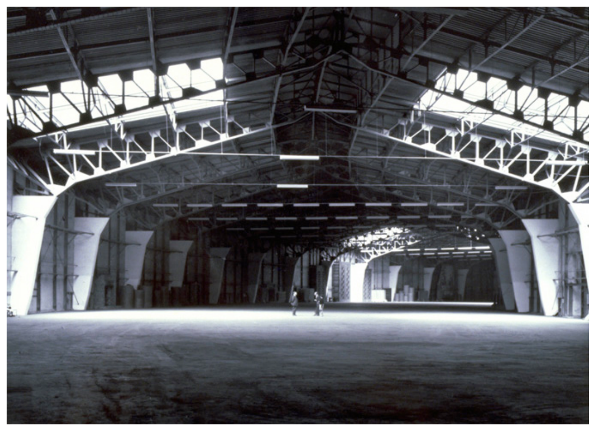
The empty Palace of Fine Arts before the Exploratorium moved in.

The other thing that surprises me is the distinction that is made between the culture and transmitting the culture through education. Museums are thought of as cultural institutions and not as educational institutions. But I do not see any essential difference between the two descriptions. To me, the whole point of education is to transmit the culture, and museums can play an increasingly important role in this process. Therefore, they are basically educational institutions. It is a mistake to think that preserving the culture is distinct from transmitting it through education. So that what Ken said about the Exploratorium, I think, is true of all museums, whether they like to admit it or not, curators are educators.