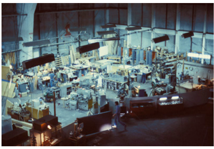
The Exploratorium's shops are on the exhibit floor visible to the visiting public.

But I also learned some negative things there. The Munich Museum presents physics in a series of rooms, and the material in each room