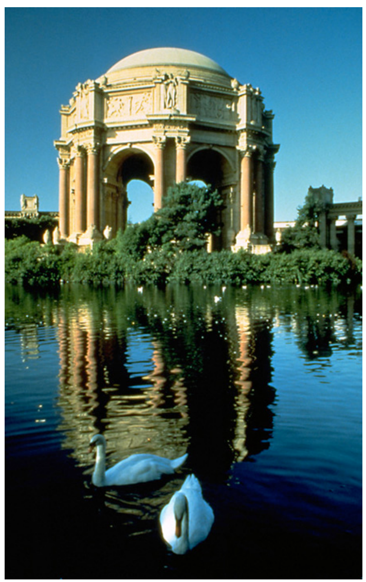
The beautiful exterior of the Palace of Fine Arts

Perception has provided a starting point for us. But from that start we have been able to go as far as we wish in both the sciences and the arts. Perception is basic, of course, to both. Dr. Parr was entranced by the Palace of Fine Arts building, and he was full of ideas for things that we could do within it. He felt we should not put up any walls. We were hoping to build a theater within the building, but he said that we should attach it to the outer curve of the building and should not obscure the wonderful 1000 foot long, 120 degree arc of space within the building. Unfortunately, we were unable to change the outside of the building to accommodate his suggestion. He remarked that it would be fine if the museums had more exhibits outside rather than inside. For example, he suggested that the whale in the American Museum hall should instead be in