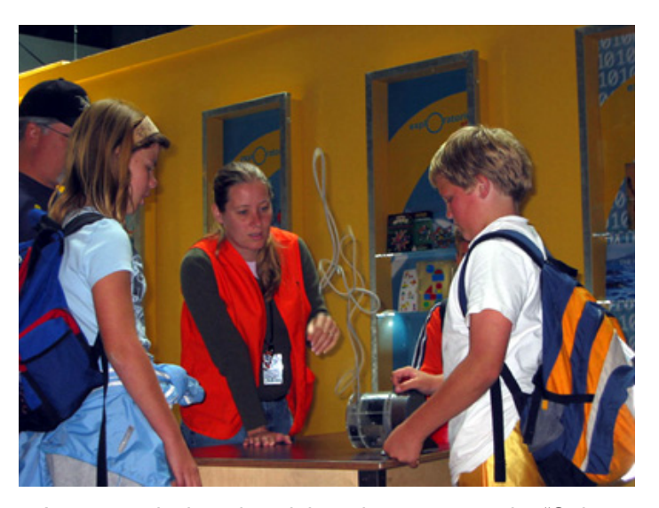
An orange-jacketed explainer demonstrates the "String Squirter" to a visiting family.

We also visited the Palais de la Decouverte in Paris where they had many college student demonstrators. These students remained in the area in between their demonstrations and answered questions about the exhibits. This feature of the Palais suggested our Explainer Program to me. We modified the idea by using paid high school students. We were able to do so because San Francisco has a program in which students can go to school in the morning and work in the afternoon.