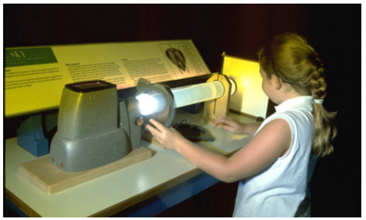
The "Blue Sky" exhibit where one learns that sunsets are red because air scatters blue light.

Of course, a particularly fine thing for me about those Colorado dioramas is that they represent something familiar to me. I had been in that kind of country. This effect is a quite general one: I have become ever more aware that the exhibits which mean the most to our visitors are those that they can connect with their past experience. But such connections are difficult to establish since each visitor has had a very different range of experiences. Yet one has to keep trying to do so through graphics and through an appropriate juxtaposition of exhibits in the hope that at least some piece of the