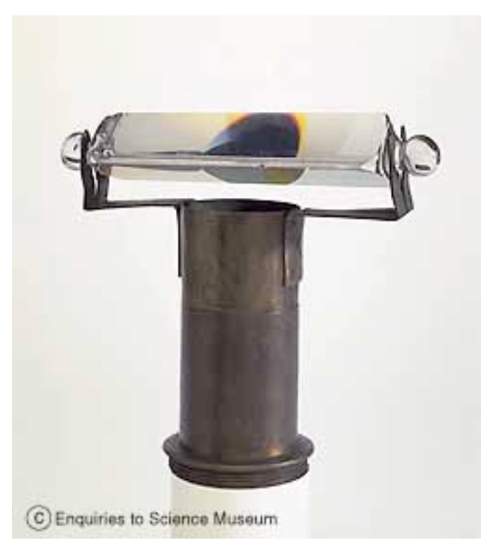
Herschel's prism at the Science Museum in South Kensington, UK

My interest in science museums was rekindled by the science museum in London. They have a wonderful collection of optics and great models of ships from all ages and all lands. Their exhibit on paper chromatography challenged me to determine how much I could learn about chromatography from the exhibit. The exhibit did not help much, but it did lead me to go to a library to learn about the subject.