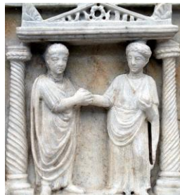
Urne au musée des Termes de Dioclétien.

http://upload.wikimedia.org/wikipedia/commons/thumb/6/67/Pompeii_-_House_of_Julia_Felix_-_2_-_MAN.jpg/349px-Pompeii_-_House_of_Julia_Felix_-_2_-_MAN.jpg