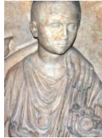
Detail from a relief showing a Roman boy wearing a bullae

http://upload.wikimedia.org/wikipedia/commons/thumb/0/0a/Vettii2.jpg/320px-Vettii2.jpg