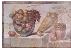
Wall painting from Pompeii (ca. 70 AD) depicting autumn produce: grapes, apples, and pomegranates overflowing a large glass bowl, next to a tilting amphora and a terracotta pot of preserved fruit

http://upload.wikimedia.org/wikipedia/commons/thumb/b/b7/Sarcophagus_Marcus_Cornelius_Staius_Louvre_Ma659_n1.jpg/360px-Sarcophagus_Marcus_Cornelius_Staius_Louvre_Ma659_n1.jpg