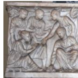
Roman girls playing a game