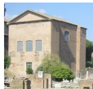
Curia Iulia no Foro Romano, Roma. Restaurado entre 1930 e 1936.

http://upload.wikimedia.org/wikipedia/commons/thumb/b/b8/Atrium_interior.jpg/359px-Atrium_interior.jpg