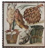
English: Fish and vegetables hanging up in a cupboard, still-life. Mosaic, Roman artwork, 2nd century CE. From a villa at Tor Marancia, near the Catacombs of Domitilla. Français : Poisson et légumes suspendus dans un garde-manger, nature morte. Mosaique, œuvre romaine, IIe siècle ap. J. -C. Provenance : environs d'une villa à Tor Marancia, près des catacombes de Domitilla.

http://upload.wikimedia.org/wikipedia/commons/thumb/5/52/Bronze_young_girl_reading_CdM_Paris.jpg/320px-Bronze_young_girl_reading_CdM_Paris.jpg