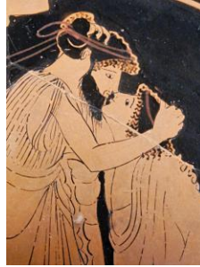
Erastes (lover) and eromenos (beloved) kissing. Tondo of an Attic red-figured cup.

http://upload.wikimedia.org/wikipedia/commons/4/40/El-matrimonio-romano.jpg