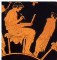
Museé de Berlín.

http://upload.wikimedia.org/wikipedia/commons/thumb/4/49/Dextrorum_iunctio_edited.JPG/444px-Dextrorum_iunctio_edited.JPG