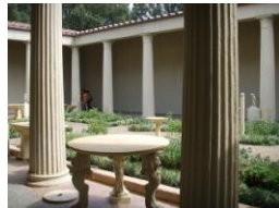
Reconstruction of the peristyle (without fresco decor), made for an exhibition in the Boboli Gardens, 2007

http://upload.wikimedia.org/wikipedia/commons/thumb/9/92/Dr%C3%A4kt%2C_Romare%2C_Nordisk_familjebok.png/108px-Dr%C3%A4kt%2C_Romare%2C_Nordisk_familjebok.png