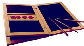
Reproduction of an ancient Roman wax tablet with three styli