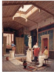
Atrio domus pompeiana. Luigi Bazzani. Dahesh Museum of Art.

http://upload.wikimedia.org/wikipedia/commons/1/19/RomaAraPacis_ProcesioneSudParticolare.jpg