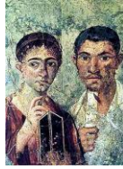
Retrato de P. Próculo e dona. Acuarela de Pompeia. S. I. Museo Nacional de Nápoles.

http://upload.wikimedia.org/wikipedia/commons/thumb/1/11/Pompeii-couple.jpg/250px-Pompeii-couple.jpg