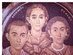
Miniature painting on gilded glass medallion [1] from Santa Giulia Museum in Brescia, mounted on King Desiderius's Cross. It was considered in XVIII c., that medallion depicts a portrait of Galla Placidia with her children. However modern scholars have firmly rejected this identification. [2]. Inscriptions on medallion are not names but some words in coptic language.

http://upload.wikimedia.org/wikipedia/commons/thumb/a/ac/Pompejanischer_Maler_um_70_001.jpg/800px-Pompejanischer_Maler_um_70_001.jpg