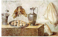
Still life showing eggs, thrushes, napkin: from the House of Julia Felix, Pompeii

http://upload.wikimedia.org/wikipedia/commons/thumb/e/e1/House_of_Julia_Felix_still_life_eggs.jpg/320px-House_of_Julia_Felix_still_life_eggs.jpg