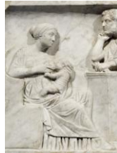
Mother breastfeeding a baby in the presence of the father. Detail from the sarcophagus of Marcus Cornelius Staius, who died as a young child.

http://upload.wikimedia.org/wikipedia/commons/thumb/9/93/Spielende_M%C3%A4dchen.JPG/478px-Spielende_M%C3%A4dchen.JPG