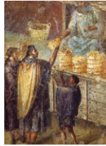
Venda de pan nun posto do mercado. Fresco romano da Praedia de Julia Fenix en Pompeia Museo Archeologico Nazionale Naples.

http://upload.wikimedia.org/wikipedia/commons/0/01/Egyptiangeesefeeding.jpg