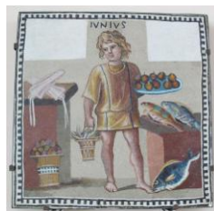
A boy holding a platter of fruits and what may be a bucket of crabs, in a kitchen with fish and squid, on the June panel from a mosaic depicting the months (3rd century) [4]

http://en.wikipedia.org/wiki/File:Ricostruzione_del_giardino_della_casa_dei_vetii_di_pompei_(mostra_al_giardino_di_boboli,_2007)_04.JPG