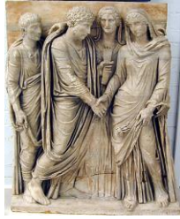
Matrimonio entre dous cidadáns romanos. Mural dun sarcófago no museo de Capodimonte.

http://upload.wikimedia.org/wikipedia/commons/4/40/El-matrimonio-romano.jpg