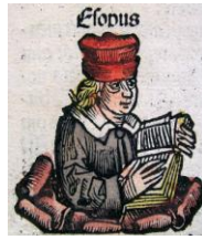
Depiction of Aesop from the Nuremberg Chronicle. Published in 1493

http://upload.wikimedia.org/wikipedia/commons/d/df/Aesopnurembergchronicle.jpg