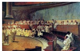
Representación dunha sesión do Senado romano: Cicerón ataca a Catilina . Fresco do século XIX.

http://en.wikipedia.org/wiki/File:Herkulaneischer_Meister_002.jpg