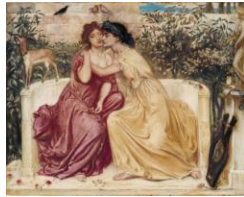
Sappho and Erinna in a Garden at Mytilene - Simeon Solomon 1840-1905

http://upload.wikimedia.org/wikipedia/commons/thumb/6/66/Gustave_Moreau - Mort de Sapho.jpg/453px-Gustave Moreau - Mort de Sapho.jpg