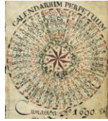
Perpetual Calendar (Julian) of 1690 from Graubünden/CH (The Gregorian Calendar was first used in the eighth century)

http://upload.wikimedia.org/wikipedia/commons/c/c8/Fox %26 Grapes.jpg