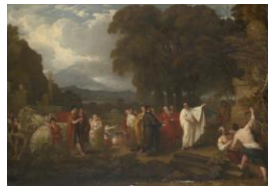
Cicero Discovering the Tomb of Archimedes , by the American artist Benjamin West

http://upload.wikimedia.org/wikipedia/commons/thumb/6/6c/Sappho and Erinna in a Garden at Mytilene.jpg/688px-Sappho and Erinna in a Garden at Mytilene.jpg?uselang=it