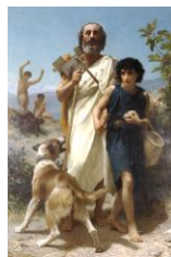
Homer and His Guide , by William-Adolphe Bouguereau (1825–1905), portraying Homer on Mount Ida, beset by dogs and guided by the goatherder Glaucus (as told in Pseudo-Herodotus)

http://upload.wikimedia.org/wikipedia/commons/thumb/9/98/Fasti Praenestini Massimo n1.jpg/536px-Fasti Praenestini Massimo n1.jpg