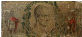
William Blake - Marcus Tullius Cicero - Manchester City Gallery

http://upload.wikimedia.org/wikipedia/commons/f/f3/Assassinat de Cic%C3%A9ron.jpg