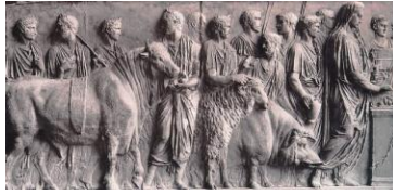
Un sacrificio na Antiga Roma.

http://upload.wikimedia.org/wikipedia/en/b/bb/Suovetaurilia.jpg