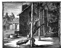
The illustration of the fable by François Chauveau in the first volume of La Fontaine's fables, 1668

http://upload.wikimedia.org/wikipedia/commons/thumb/b/ba/Adriaan_van_stalbeem_-_landscape_with_fables_1620.jpg/640px-Adriaan_van_stalbeem_-_landscape_with_fables_1620.jpg