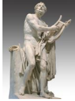
Homero . Philippe-Laurent Roland 1746-1816.

http://commons.wikimedia.org/wiki/File:William-Adolphe_Bouguereau_(1825-1905)_-Homer_and_his_Guide_(1874).jpg