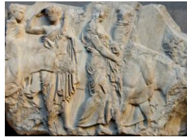
Bois levados ao sacrificio do friso sur do Partenón.

http://upload.wikimedia.org/wikipedia/en/b/bb/Suovetaurilia.jpg