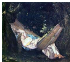
A hamaca. Gustave Courbet (1844).

http://upload.wikimedia.org/wikipedia/commons/thumb/8/8f/CumaeenSibylByMichelangelo.jpg/399px-CumaeenSibylByMichelangelo.jpg