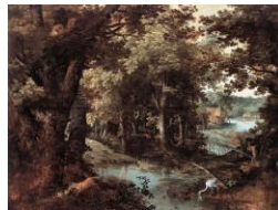
Landscape with Fables

http://upload.wikimedia.org/wikipedia/commons/thumb/e/ed/Diego_Vel%C3%A1zquez_003.jpg/304px-Diego_Vel%C3%A1zquez_003.jpg