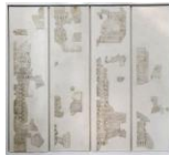
Fasti Praenestini , calendar of Verrius Flaccus

http://upload.wikimedia.org/wikipedia/commons/thumb/e/e7/Gustav Klimt_064.jpg/379px-Gustav Klimt_064.jpg