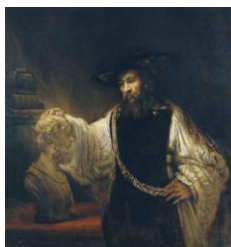
Aristotle Contemplating the Bust of Homer or Aristotle with a Bust of Homer

http://upload.wikimedia.org/wikipedia/commons/f/f5/Victen_Roman_muse_mosaic.jpg