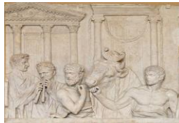
Preparación dun sacrificio. Mámore, fragmento dun relevo arquitectónico, primeiro cuarto do século II a. C. De Roma, Italia.

http://upload.wikimedia.org/wikipedia/commons/thumb/7/79/Sacrifice_south_frieze_Parthenon_BM.jpg/318px-Sacrifice_south_frieze_Parthenon_BM.jpg