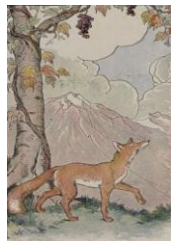
A raposa e as uvas . Unha ilustración de Milo Winter para una antoloxía de Esopo, 1919.

http://upload.wikimedia.org/wikipedia/commons/thumb/8/8e/Gaius_Comelius_Tacitus.jpg/468px-Gaius_Comelius_Tacitus.jpg