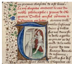
The assassination of Cicero , unknown.

http://upload.wikimedia.org/wikipedia/commons/a/a6/Cicero Discovering the Tomb of Archimedes by Benjamin West.jpeg