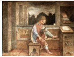
The Young Cicero Reading by Vincenzo Foppa (fresco, 1464), now at the Wallace Collection

http://upload.wikimedia.org/wikipedia/commons/thumb/5/57/Andrea_del_Castagno_005.jpg/217px-Andrea_del_Castagno_005.jpg