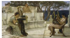
Sappho and Alcaeus by Lawrence Alma-Tadema. On view at The Walters Art Museum

http://upload.wikimedia.org/wikipedia/commons/thumb/4/4f/The_Young_Cicero_Reading.jpg/632px-The_Young_Cicero_Reading.jpg