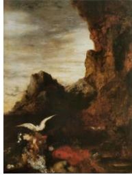
Sappho's death , Gustave Moreau, 1826-1898

http://upload.wikimedia.org/wikipedia/commons/thumb/6/66/Gustave_Moreau - Mort de Sapho.jpg/453px-Gustave Moreau - Mort de Sapho.jpg