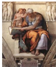
Sibila de Cumas. Michelangelo Buonarroti (1475-1564).

http://upload.wikimedia.org/wikipedia/commons/thumb/0/0e/Roman_sacrifice_Louvre_Ma992.jpg/572px-Roman_sacrifice_Louvre_Ma992.jpg