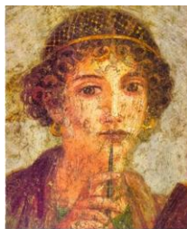
Safo de Lesbos contemplando o calendario para compoñer os seus poemas . 660 a. C.

http://upload.wikimedia.org/wikipedia/commons/thumb/e/e1/The_Fox_and_the_Grapes_-_Project_Gutenberg_etext_19994.jpg/351px-The_Fox_and_the_Grapes_-_Project_Gutenberg_etext_19994.jpg