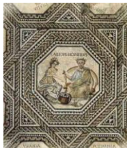
Homer in the company of Calliope, the Muse of epic poetry (replica of Roman Imperial mosaic, c. 240 AD, from Vichten)

http://upload.wikimedia.org/wikipedia/commons/thumb/0/02/Sir_Lawrence_Alma-Tadema%2C_RA%2C_OM_-_Sappho_and_Alcaeus_-_Walters_37159.jpg/640px-Sir_Lawrence_Alma-Tadema%2C_RA%2C_OM_-_Sappho_and_Alcaeus_-_Walters_37159.jpg