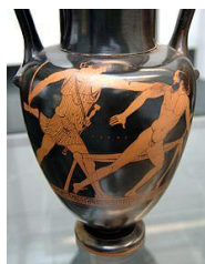
Teseo e Procrustes. Lado A dunha ánfora ática de figuras vermellas. 470 a. C.

http://upload.wikimedia.org/wikipedia/commons/thumb/1/11/Lekythos_Cretan_bull_Louvre_F455.jpg/504px-Lekythos_Cretan_bull_Louvre_F455.jpg