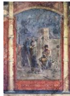
Alimentación de Dionisos. Mestre romano. Palazzo Massimo alle Terme.