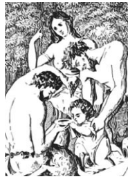
Panacea axuda a un enfermo. Detalle dun gravado do médico veronés J. Gazola. 1716.

http://upload.wikimedia.org/wikipedia/commons/thumb/b/bc/Pompeji_Casa_Dei_Vettii_Hercules_Child_Detail.jpg/258px-Pompeji_Casa_Dei_Vettii_Hercules_Child_Detail.jpg