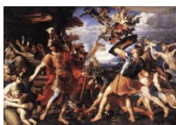
Eneas e os seus compañeiros loitando contra as Harpías. François Perrier. Museo do Louvre.

http://upload.wikimedia.org/wikipedia/commons/thumb/c/c8/Didrachm_Phaistos_obverse_CdM.jpg/480px-Didrachm_Phaistos_obverse_CdM.jpg