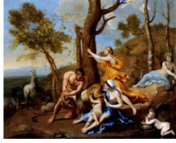
A infancia de Xúpiter. Nicolás Poussin. Dulwich Picture Gallery.

http://upload.wikimedia.org/wikipedia/commons/thumb/c/ca/La_Nourriture_de_Jupiter_-_Poussin_-_DulwichPG.jpg/304px-LaNourriture_de_Jupiter_-_Poussin_-_DulwichPG.jpg