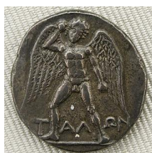
Talos representado como un home novo espido e alado, armado cunha pedra

http://upload.wikimedia.org/wikipedia/commons/thumb/f/fb/Guido_Reni_038.jpg/366px-Guido_Reni_038.jpg