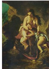
Medea furiosa. Eugène Delacroix.

http://upload.wikimedia.org/wikipedia/commons/thumb/b/b3/Chimera_Apulia_Louvre_K362.jpg/480px-Chimera_Apulia_Louvre_K362.jpg