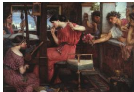
Penélope e os pretendentes. John William Waterhouse.

http://upload.wikimedia.org/wikipedia/commons/thumb/4/42/Johann_Heinrich_F%C3%BCssli_054.jpg/382px-Johann_Heinrich_F%C3%BCssli_054.jpg