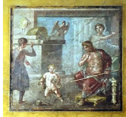
Anfitrión comproba que Hércules non é fillo seu véndolle matar as serpes. Fresco da casa dos Vettii (Pompeia).

http://upload.wikimedia.org/wikipedia/commons/thumb/c/ca/La_Nourriture_de_Jupiter_-_Poussin_-_DulwichPG.jpg/304px-LaNourriture_de_Jupiter_-_Poussin_-_DulwichPG.jpg