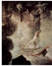
Odiseo ante Escila e Caribde. Johann Heinrich Füssli.

http://upload.wikimedia.org/wikipedia/commons/thumb/f/f4/Nicolas_Poussin_066.jpg/640px-Nicolas_Poussin_066.jpg