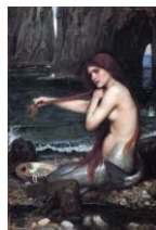
Serea, de John William Waterhouse (1849-1917).

http://commons.wikimedia.org/wiki/File: Pinturicchio - The Return of Odysseus - WGA17830.jpg