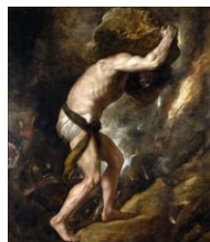
Sísifo. Tiziano. Museo do Prado.

http://upload.wikimedia.org/wikipedia/commons/thumb/3/38/Eug%C3%A8ne_Ferdinand_Victor_Delacroix_031.jpg/344px-Eug%C3%A8ne_Ferdinand_Victor_Delacroix_031.jpg