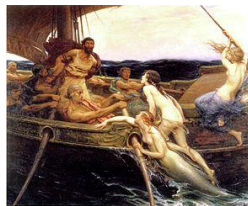
Ulises e as sereas. Herbert James Draper.

http://upload.wikimedia.org/wikipedia/commons/b/bf/JohnWilliamWaterhouse-PenelopeandtheSuitors%281912%29.jpg