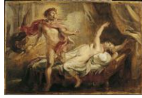
A morte de Sémele. Peter Paul Rubens. (1577-1640). Royal Museums des Beaux Arts. Bélgica.

http://upload.wikimedia.org/wikipedia/commons/e/e3/Rubens-Death-of-Semele.jpg