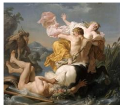
O rapto de Deianira polo centauro Neso. Louis-Jean-François Lagrenée (1724-1805). Museo do Louvre.

http://upload.wikimedia.org/wikipedia/commons/d/d5/The_Modern_Bed_of_Procrustes_-_Punch_cartoon_-_Project_Gutenberg_eText_13961.png