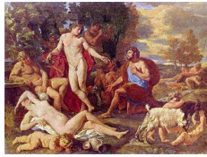
Midas e Baco. Nicolás Poussin. Schloss Nymphenburg.

http://upload.wikimedia.org/wikipedia/commons/thumb/a/aa/PanandDaphnis.jpg/302px-PanandDaphnis.jpg