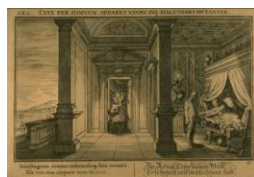
Morfeo coa forma de Ceix aparécese a Alcíone. Gravado de Bauer para as Metamorfoses de Ovidio, libro XI, 633-676.

http://upload.wikimedia.org/wikipedia/commons/thumb/4/43/Punishment_sisyph.jpg/423px-Punishment_sisyph.jpg