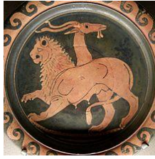
Quimera nun prato de Apulia con figuras vermellas. 350-340 a. C. Museo do Louvre.

http://upload.wikimedia.org/wikipedia/commons/thumb/b/b3/Chimera_Apulia_Louvre_K362.jpg/480px-Chimera_Apulia_Louvre_K362.jpg