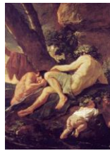
Midas lavándose no río Pactolo.