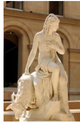
Amaltea e a cabra de Xúpiter. Pierre Julien. (1731-1804). Museo do Louvre.

http://upload.wikimedia.org/wikipedia/commons/e/e2/Enrique_Simonet_-_El_Juicio_de_Paris_-_1904.jpg