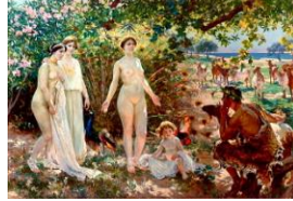
O xuício de Paris . Pintura de Enrique Simonet de 1904. Museo de Málaga.

http://upload.wikimedia.org/wikipedia/commons/e/e3/Rubens-Death-of-Semele.jpg