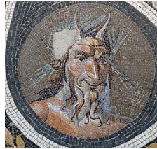
Mosaico no pavimento co busto de Pan. Obra romana de 138-192 d. C. Prové n dunha villa de Genazzano que poido ter pertencido a Marco Aurelio e Lucio Vero.

http://commons.wikimedia.org/wiki/File: Pandora - John William Waterhouse.jpg