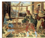
Penélope cos seus pretendentes. Pinturicchio (1454-1513). National Gallery.

http://commons.wikimedia.org/wiki/File: Midas se lavant à la source du Pactole, 1627, New-York, The Metropolitan Museum of Art.jpg