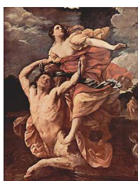
Rapto de Deianira. Guido Reni. Museo do Louvre.

http://upload.wikimedia.org/wikipedia/commons/1/1f/Theseus_Prokroustes_Staatliche_Antikensammlungen_2325.jpg