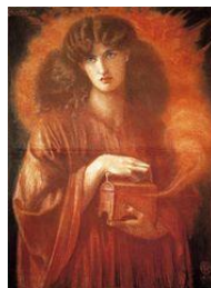
Pandora. Dante Gabriel Rossetti.

http://upload.wikimedia.org/wikipedia/commons/9/95/Bauer_-_Ceix-Morpheus_Alcyone.jpg