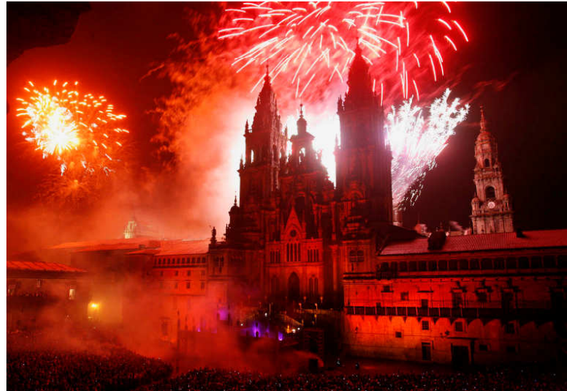
Fireworks in Santiago de Compostela 25 th July of 2008

The next day in the Cathedral of Santiago begin the acts to commemorate the Day of Galicia, with the traditional gifts to the Apostle that include the spectacular flight of the “botafumeiro”-an enormous pot full of incense, which purifies people.