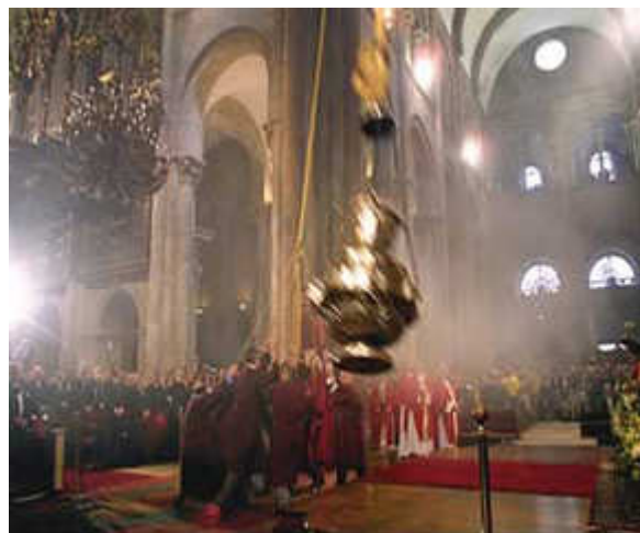
Botafumeiro inside the cathedral

The next day in the Cathedral of Santiago begin the acts to commemorate the Day of Galicia, with the traditional gifts to the Apostle that include the spectacular flight of the “botafumeiro”-an enormous pot full of incense, which purifies people.