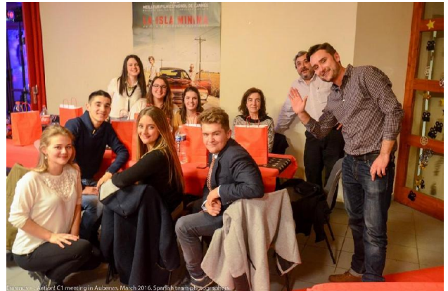
Erasmus + Action! C1 meeting in Aubenas, March 2016. Spanish team photographers