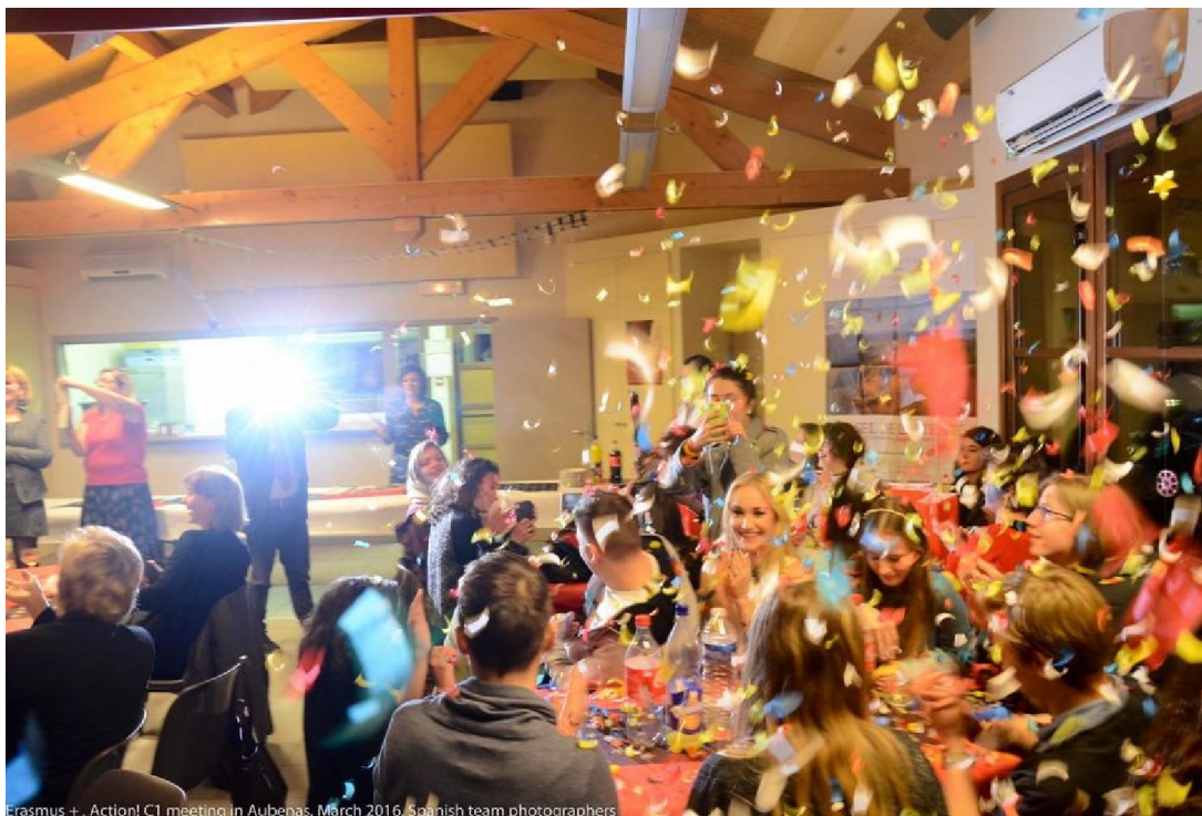
Erasmus + Action! C1 meeting in Aubenas, March 2016. Spanish team photographers

party where we all had dinner, and the French team gave the certificates of attendance to the students and teachers, and some gifts for the students. Students said goodbye to each other, shared a lot of hugs and said a little sad goodbye to this unforgettable week full of new friends and experiences, for some of them the best week of their lives.