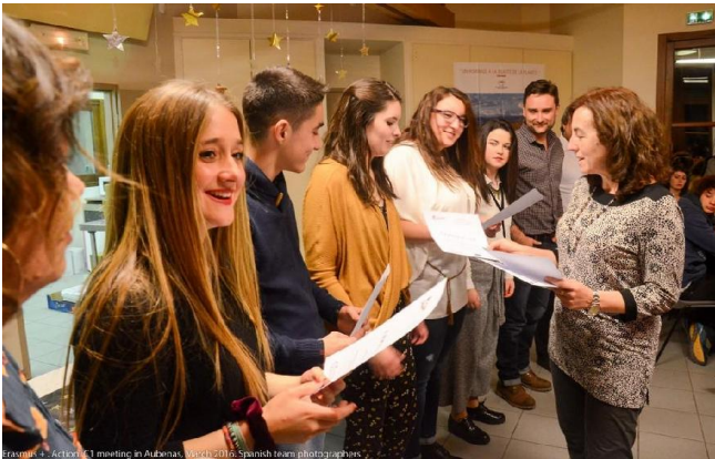
Erasmus + Action! C1 meeting in Aubenas, March 2016. Spanish team photographers

During the evening, all of us had free time to visit Aubenas for our own, and some students were decorating the place where the goodbye party was going to take place. At eight o'clock all of us joined the