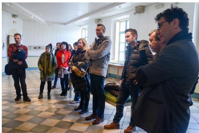
Erasmus+ - Action C1 meeting in Aubenas, March 2016. Spanish team photographers

Poland and Turkey-Spain. Both teams enjoyed a lot writing and recording the scenes in the library and places nearby. At the end of the afternoon, the students had finished creating their short films.