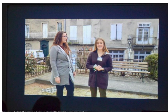
Erasmus+ - Action C1 meeting in Aubenas, March 2016. Spanish team photographers

webpage and work out on the teacher's questionnaire to evaluate the meeting in Aubenas. After that, the students showed the result of their work to the whole group of students and teachers, as well as the short film created the previous day. It was expected that the films made by the teachers were shown but they both couldn't finish them because of technical problems with the computers compatibility. The expectation among the students about our short films was really high, so they were a little frustrated. We promised to