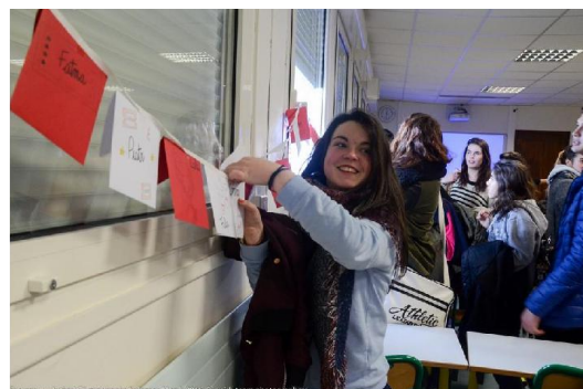
Erasmus+ - Action C1 meeting in Aubenas, March 2016. Spanish team photographers

webpage and work out on the teacher's questionnaire to evaluate the meeting in Aubenas. After that, the students showed the result of their work to the whole group of students and teachers, as well as the short film created the previous day. It was expected that the films made by the teachers were shown but they both couldn't finish them because of technical problems with the computers compatibility. The expectation among the students about our short films was really high, so they were a little frustrated. We promised to