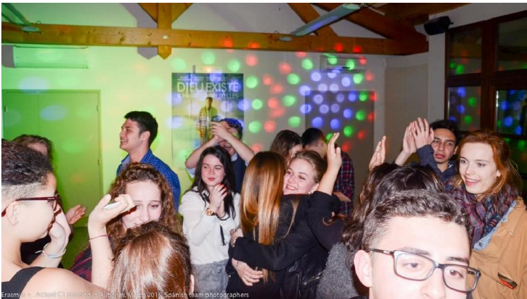
Erasmus + Action! C1 meeting in Aubenas, March 2016. Spanish team photographers

party where we all had dinner, and the French team gave the certificates of attendance to the students and teachers, and some gifts for the students. Students said goodbye to each other, shared a lot of hugs and said a little sad goodbye to this unforgettable week full of new friends and experiences, for some of them the best week of their lives.