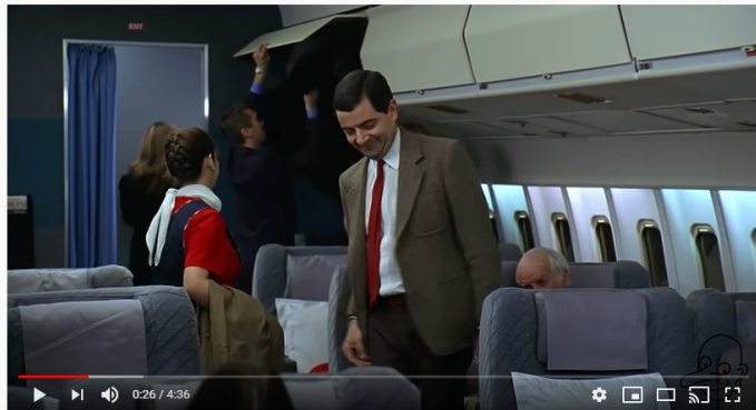
[HD] First Class Flight (Mr. Bean)

Watch the following video and choose the correct answer: stewardess: asistente de vuelo chase: perseguir