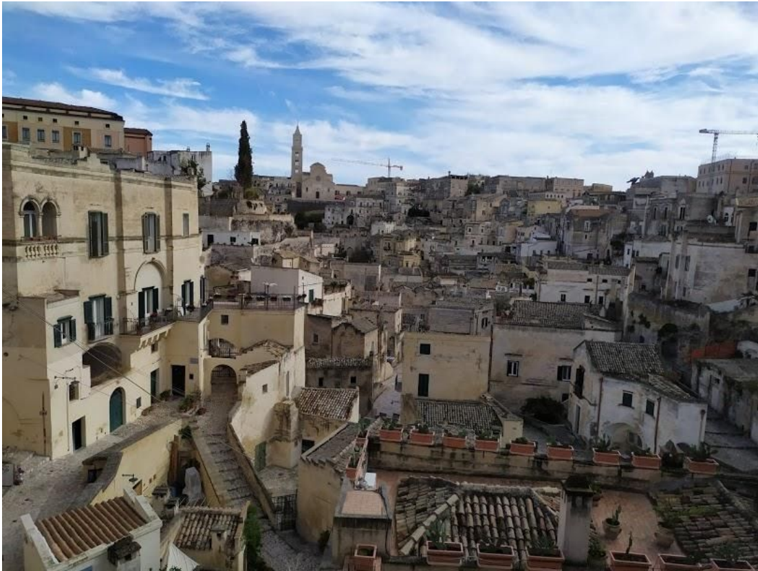
Sassi di Matera