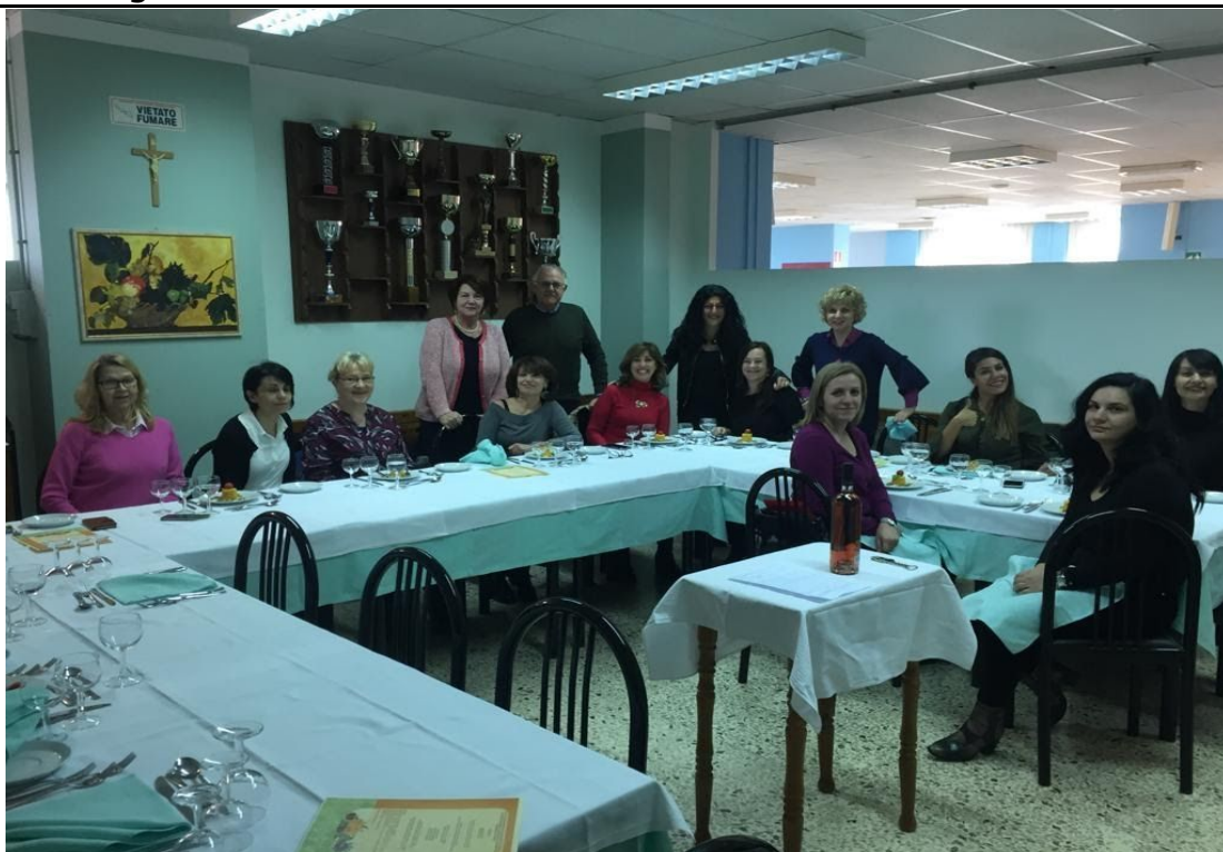
Meeting the "staff".