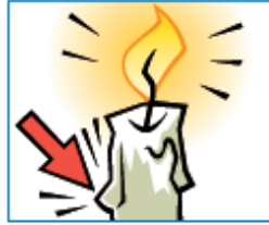
wax = a material we use to make candles