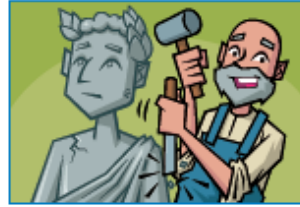
sculptor = an artist who makes models