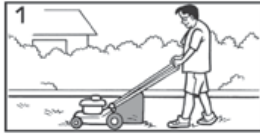
1 Sean is cutting the grass.

cut the grass water the flowers plant seeds pick strawberries feed the birds make a window box eat a carrot dig a hole