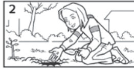
2 Rosie _____