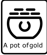
A pot of gold