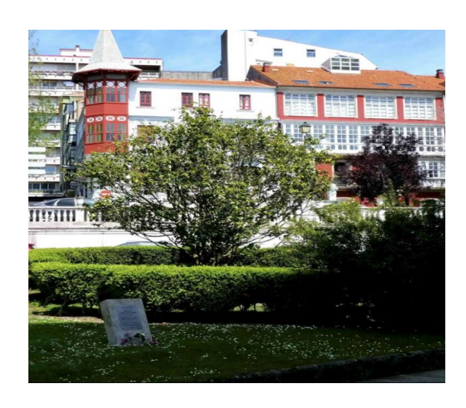
Chalé de Antón