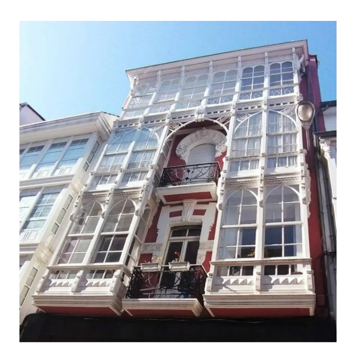
Casa Rodríguez Trigo