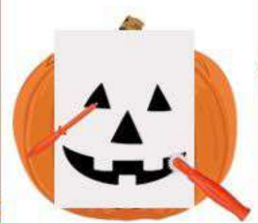
Trace design using a dry erase marker.