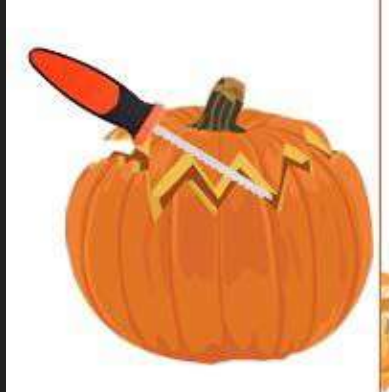
1. Create a lid in a zig zag pattern.

3. AT HOME, PAINT OR CARVE YOUR PUMPKIN TO MAKE A JACK-O-LANTERN AND PUT IT OUTSIDE,