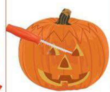
4. Make slow and gentle cuts according to the pattern.