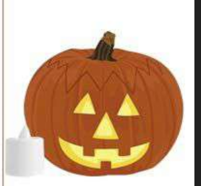
5. Add a tea light!