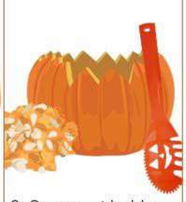
2. Scoop out insides.